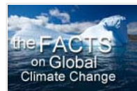
Facts on Global Climate Change