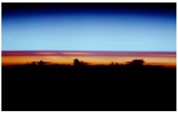
Figure 3: The eruption of Mount Pinatubo (left) injected large quantities of sulfur dioxide into the stratosphere (right) where it remained for several years in the 2 layers seen here at \sim 30 km altitude, causing global cooling of several tenths of a degree.

A 1992 report of the National Research Council<sup>4</sup> was the first to systematically estimate the potential costs of a program of stratospheric albedo modification. Their estimate was based on the use of a standard naval gun system dispensing commercial aluminum oxide dust to counteract the warming effect of a CO<sub>2</sub> doubling. Undiscounted annual costs for a 40-year project were estimated to be $100 billion. More recent analysis<sup>5</sup> has suggested that well designed systems might reduce this cost to as little as a few hundred million dollars per year – clearly well within the budget of almost all nations, and much less costly than any program to dramatically reduce the emissions of CO<sub>2</sub>. Indeed, there are a handful of individuals who could create the endowment necessary to generate an annual annuity to operate such a program.